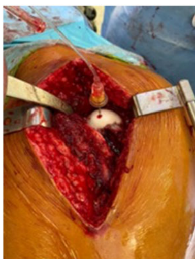
Fig. 3. Intraosseous needle placed into 1.5 mm drill hole in femoral epiphysis to assess femoral head perfusion.