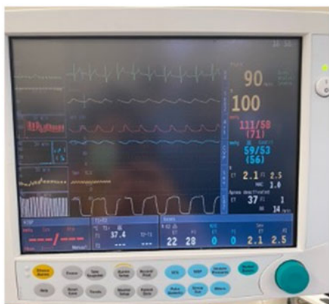
Fig. 4. Arterial monitor showing the presence of a pulsatile waveform (blue) indicating that the femoral head is perfused.

depending on the surgeon involved and degree of the slip but usually entailed 6–12 weeks of non-weight bearing on the affected side, with gradual increasing in weight bearing if deemed suitable at that follow-up appointment. Serial radiographs were performed to look for development of AVN, femoral head collapse, physal closure and union of osteotomies at follow-up clinic appointments. Follow-up was continued until skeletal maturity.