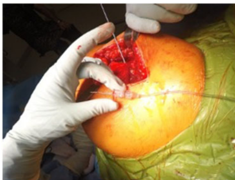
Fig. 2. Intraosseous needle before insertion into femoral epiphysis.