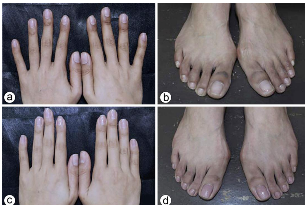
Fig. 1. Hyperpigmentation of both hands and feet. Initially, the patient showed multiple asymptomatic hyperpigmented macular patches over the dorsa of the fingers (a) and toes (b). After about 1 month of vitamin B12 (cyanocobalamin) therapy, the pigmented lesions showed considerable improvement (c, d).