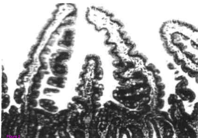
Figure 1 Total villous atrophy with crypt hyperplasia of the second portion of duodenum (Marsh III; lesion).

A central point in our study is that patient was symptomatic as affected of celiac disease although he was following a gluten-free diet and that these symptoms was