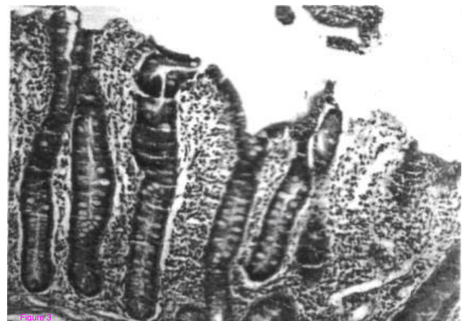
Figure 3 Normal histology of the small bowel 12 months after gluten withdrawal.