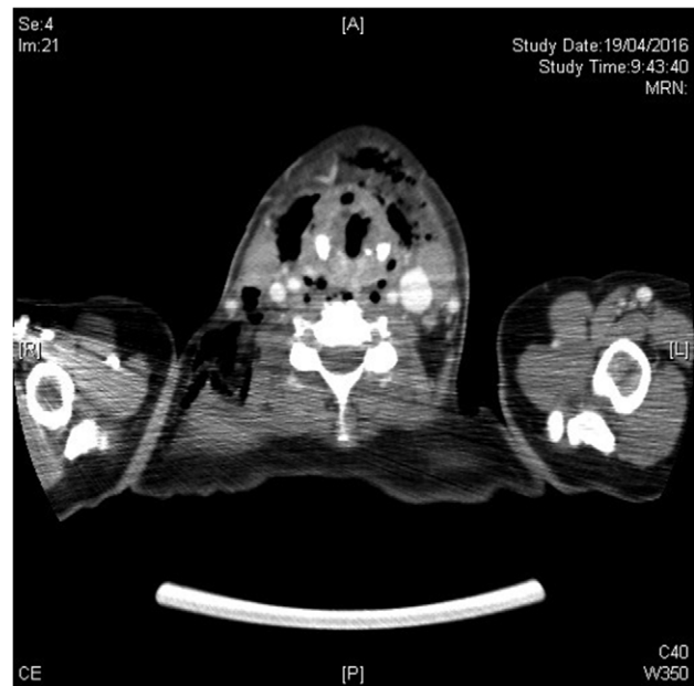
Figure 1: Extensive involvement to all deep neck spaces.

Candidaemia is by far the most frequent clinical syndrome of invasive candidiasis. It can be associated with deep tissue infection, such as intra-abdominal candidiasis, candida endocarditis, ocular candidiasis and candida meningitis. The gold