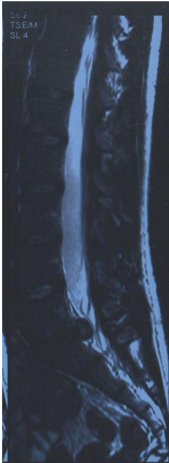
Figure 1 . Lumbosacral spine MRI.

Eur J Trans Myol - Basic Appl Myol 2014; 24 (3): 203-207