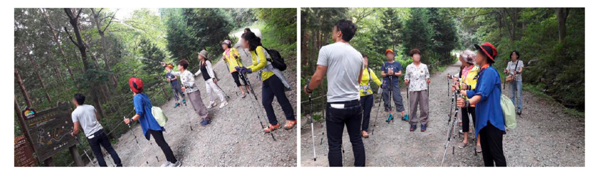
Figure 2. Forest therapy program. Participants were taking a walk in the forest and listening to explanations about tree and forest animals.