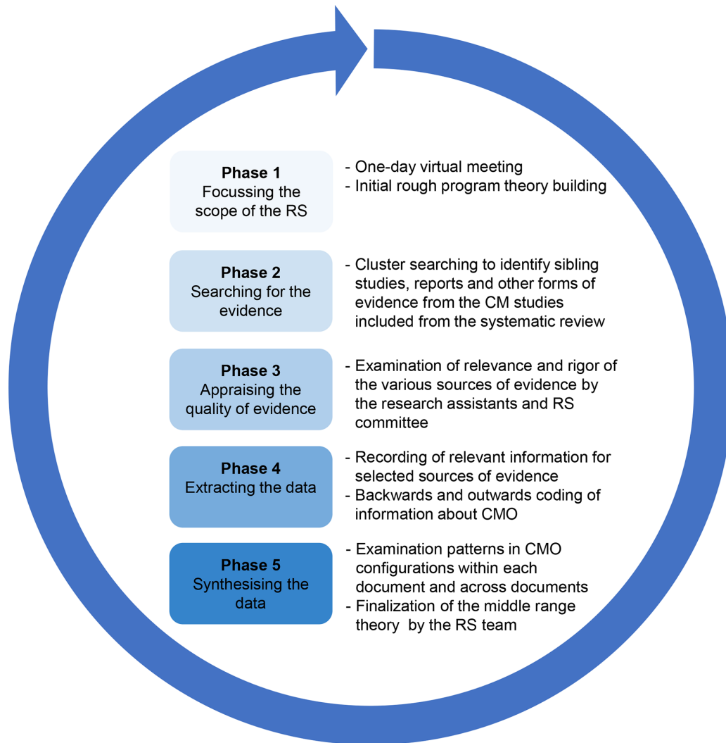
Figure 1 RS design. CM, case management; CMO, context, mechanism and outcomes; RS, realist synthesis.

with the four main components identified in documents about CM, 35 36 research articles from this field 37 38 and our previous work 24 : (1) case finding; (2) care planning; (3) coordination/integration of services; and (4) self-management support (figure 2). This will provide the starting point for a process of discussion and consensus building regarding an initial rough theory of CM. Drawing on external stakeholder expertise is strongly encouraged to focus the RS. 39