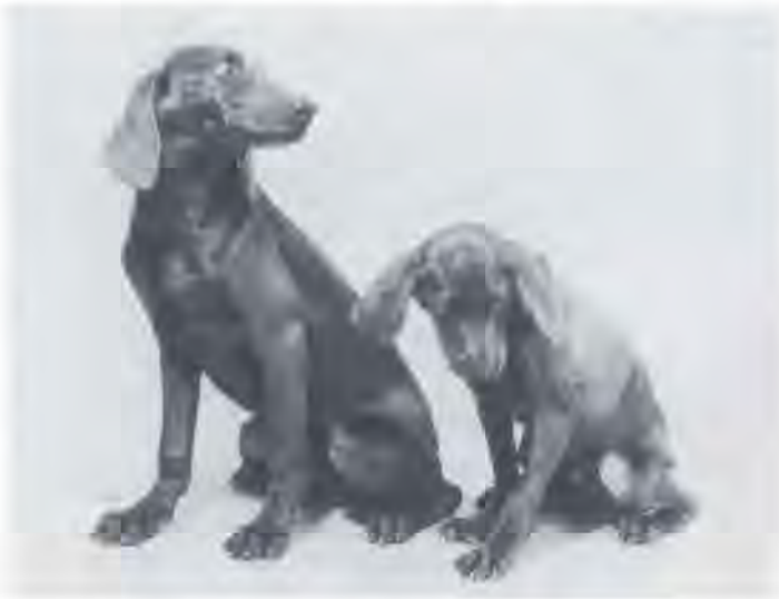
Figure 1. Two male Weimaraner siblings (15 weeks old) from a colony of dogs affected with immunodeficient dwarfism. The smaller dog has the wasting syndrome; his littermate is unaffected.

went atrophy or if they never developed fully and, therefore, were hypoplastic. A few neonatal pups from the Weimaraner colony that died from maternally inflicted trauma or were euthanized had a small rudimentary thymus without a discernible cortex. This suggests that the thymus glands failed to develop normally in utero in the affected pups.