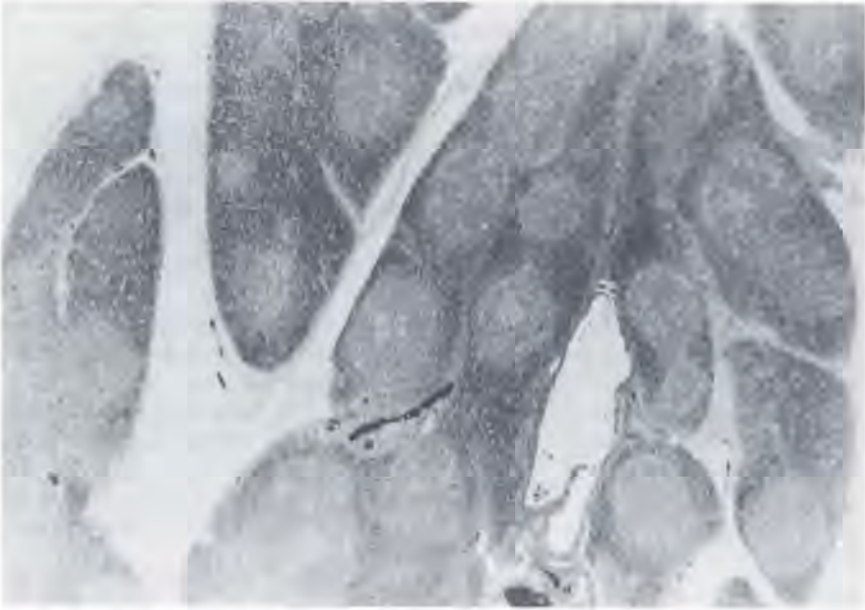
Figure 2. Biopsy of the thymus gland from the 15-week-old Weimaraner with the wasting syndrome shown in Figure 1. There is an overall decrease from normal in the size of the gland and the cortex-to-medulla ratio. In some areas, the cortex is distinguishable only as a rim of tissue in the periphery of the lobule. There is increased width and adipose tissue content of the interlobular septae. 30 X-magnification.

hormone-induced somatomedin activity) or it may be due to a thymic hormone (or hormones) that is (are) induced by growth hormone. The growth hormone therapy did not cause a consistent increase in the serum concentration of thymosin alpha 1. The pups were apparently not deficient in thymosin alpha 1 before therapy with growth hormone.