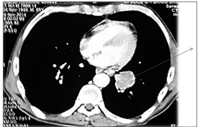
Figure 2: Contrast enhanced computed tomography hip region showing muscle metastasis with underlying bone.