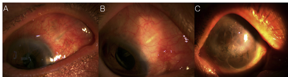
Fig. 3. Result of treatment using lenticule in case 1, 2 and 3. (A) At postoperative 8 months, the suture site was well maintained without Ahmed valve-tube exposure in case 1. (B) At postoperative 6 months, the suture site was well maintained without Ahmed valve-tube exposure in case 2. (C) At postoperative 3 months, the patient's right eye was stable, without displacement or melting of the lenticule graft in case 3.

Indeed, the stromal lenticule has several merits. First, it offers the benefits of the corneal patch graft. As is known, the corneal patch graft provides good biocompatibility and strength, and compared with the scleral patch graft, it is thin and transparent, and thus cosmetically superior. 1,10 The stromal lenticule, significantly, is even thinner than