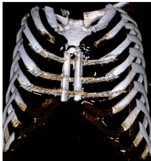
Fig. 3. Three-dimensional chest computed tomography (CT) scan demonstrating successful double barrel fibula free flap. Chest CT scan three-dimensional reconstruction showing a vertically oriented double barrel fibula free flap and titanium plates secured across both fibula segments and level of ribs 3, 4, and 5.

Bone grafts are beneficial options for reconstruction because they are capable of incorporating into recipient tissue with revascularization and cellular repopulation, rendering them more resistant to postoperative infection [1]. While bony reconstruction has demonstrated positive outcomes, there is a paucity of data for its use in sternal defects [9]. In addition to vascularized fibula grafts, other autologous bone reconstruction options have been used to surgically manage large sternal defects for skeletal rigidity. In their case series, Haraguchi et al. [10] reported that three of their 15 patients underwent autologous bone grafting