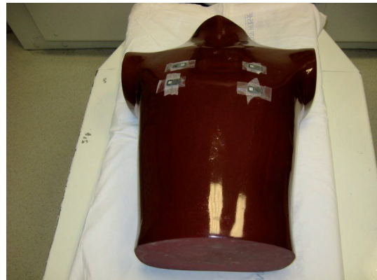
FIGURE 3: Image of adult phantom with four nanoDots (Landauer, Inc., Glenwood, IL) placed on the anterior surface corresponding to the breast region.

of 120 kVp, 0.5-second rotation time, 1.2 pitch, 128 \times 0.6 mm effective collimation. Tube current modulation was used with reference mA of 110.