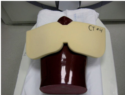
FIGURE 5: Image of anthropomorphic phantom with bismuth breast shield (AttenuRad Radiation Protection; F & L Medical Co., Vandergrift, PA; 0.060 mm Pb equivalent) placed on anterior surface on top of padding.

2.2. Patient Study Assessing CT Image Quality and Noise with Breast Shield in Place. This retrospective study was approved by the institutional review board and was in compliance with HIPAA regulations and informed consent was waived. Between December 2008 and February 2009, 50 female patients with chest CTs performed for clinical indications obtained both with and without breast shields within a 12-month period were selected. The shield used was a commercially available AttenuRad CT Breast Shield System (F & L medical products, Vandergrift, PA). The breast shield was applied after topogram using 16-, 40-, 64-slice Siemens multidetector scanners protocol (256-MDCT, Siemens Medical solutions, Malvern, PA). The scan protocol was 120 kVp, 0.75 mm collimation, 3-mm slice thickness, 3-mm reconstruction interval, with images viewed in mediastinum and lung windows.