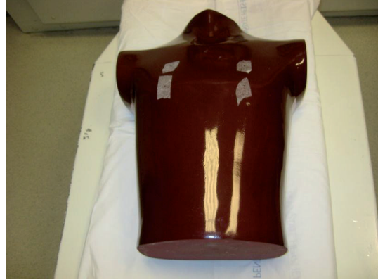
FIGURE 2: Image of adult anthropomorphic torso phantom (RS 310 lung/chest phantom, Fluke Biomedical) used.

The phantom was scanned using the parameter clinically used for adult chest CT protocol (256-MDCT, Siemens Medical solutions, Malvern, PA) consisting