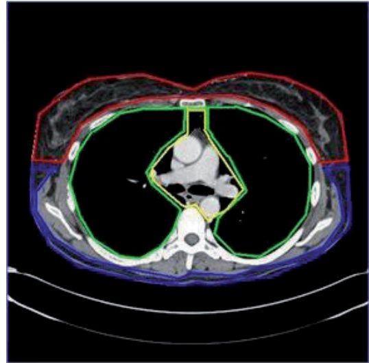
FIGURE 6: Axial contrast CT image of chest. Image delineates the six regions used in the qualitative comparison of the scans with and without the breast shield in patients. The six regions are anterior thoracic wall (red), lateral and posterior wall (blue), lung parenchyma [10], mediastinum, heart, and aorta and great vessels (all three within yellow).

2.3. Qualitative Assessment. The chest was first divided into six areas: anterior thoracic wall, lateral and posterior wall, aorta and great vessels, mediastinum, heart, and lung parenchyma (Figure 6). Two chest radiologists, each with 10 years