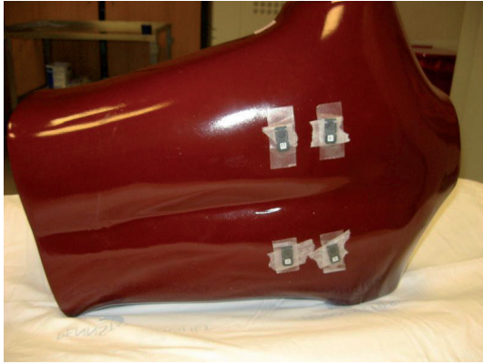
FIGURE 4: Image of adult phantom with four nanodots (Landauer, Inc., Glenwood, IL) placed on the posterior surface.