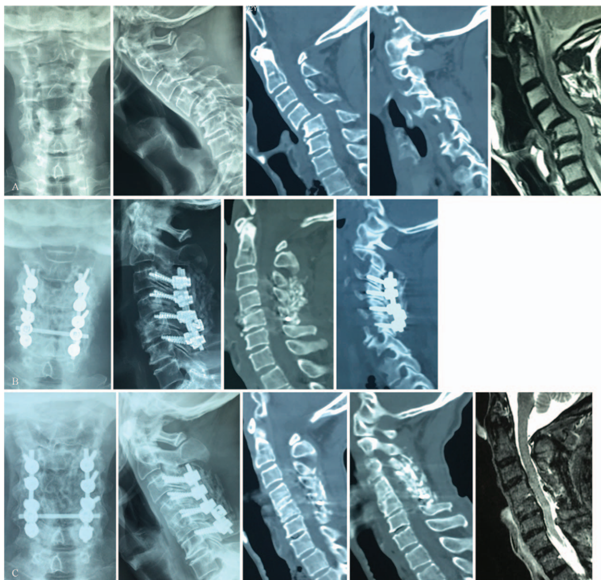
Figure 2. A 72-year-old male patient suffered from a fall injury. The diagnosis was delayed for 8 months because he just had mild neck pain after the accident. (A) Preoperative radiographs and sagittal reconstruction CT demonstrated C4–C5 dislocation with bilateral locked facets and remodeling of the facets. The MRI indicated obvious compression of the spinal cord. (B) At 1 week after surgery, radiographs and CT images showed perfect restoration of the dislocated segments and adequate amount of bone graft. (C) At 15 months of follow-up, the radiographs and CT images confirmed the anterior and posterior fusion. The CT and MRI images revealed enlarged spinal canal at C4–C5 level. CT=computed tomography, MRI=magnetic resonance imaging.

were responsible in 24%, and neurologic integrity accounted for the remaining 12%. Detailed medical history and careful physical examination must be emphasized for patients with suspected cervical spine injuries. Patients with neck pain, local tenderness, or restricted range of motion should be advised to receive more extensive radiologic examinations, such as dynamic radiographs, CT scan, and MRI. [15]