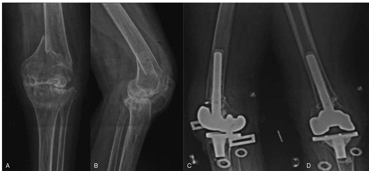
Figure 3. X-ray images illustrating TKA with femoral stem implantation for a patient with arthritis. Preoperative radiographs (A, B) of a female patient aged 57 years show an AO type A supracondylar femoral fracture with severe knee arthritis. A normal TKA complicated by a femoral stem was implanted in. Postoperative radiographs obtained 6 days after the operation show good alignment of prosthesis with the stem (C, D). AO=Arbeitsgemeinschaft für Osteosynthesefragen, TKA=total knee arthroplasty.

patient because of the complex and unstable fractures. For patients suffering from knee arthritis, mobilization in the early stage is a crucial step to maintain knee functions and to avoid medical complications of prolonged bed-bound state. After surgery, most of our patients were allowed to mobilize at an early stage without needing ancillary splintage. In a rather short inpatient stay, the arthralgia was significantly reduced, and the average ROM was 74.3^\circ at the time of hospital discharge (range: 70^\circ – 83^\circ ). In our TKA procedure, the mean time of hospitalization is 16 days while the statistics shows that the mean hospital stay for patients undergoing open reduction and internal was 31 days. [5,20,21]