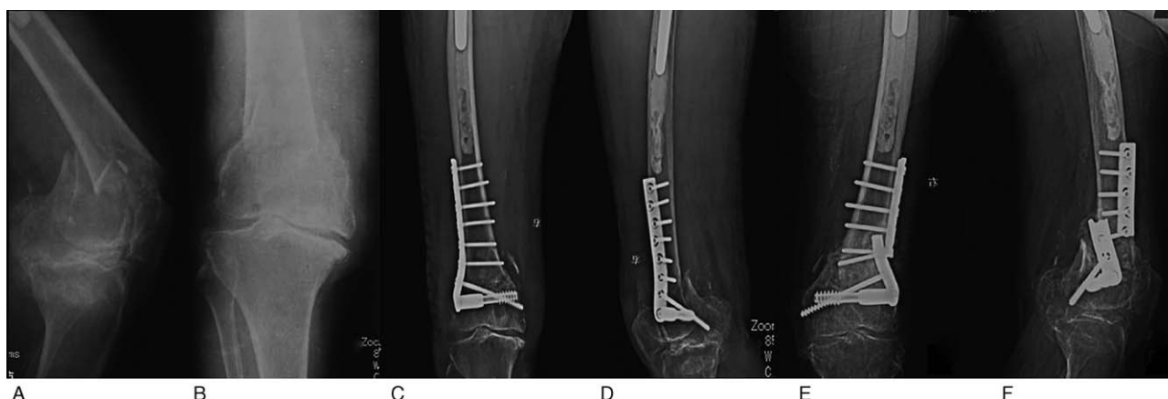
Figure 1. X-ray image of a female patient aged 90 years with the AO type C supracondylar femoral fracture before (A, B) and after traditional open reduction and internal-fixation (C, D). The implanted plate broke before the fracture had healed (E, F). AO=Arbeitsgemeinschaft für Osteosynthesefragen.

detection of radiolucent lines, the Knee Society rating system was used. [18] A radiolucent line of more than 4mm at one place or wide distribution of a radiolucent line of more than 2mm were regarded as a sign of prosthetic loosening.