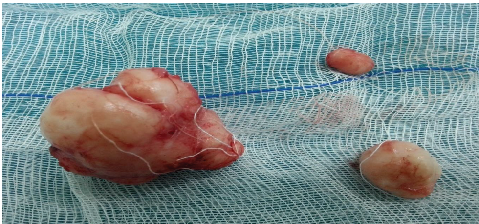
FIGURE 2: Pathological specimens.