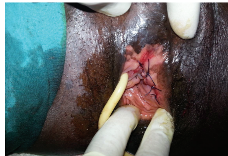
FIGURE 4: Postoperative appearance of the vulvar region.

an incision of 1 cm was made on the left anterolateral wall of the vagina. After that, the 5-cm solid mass was excised totally with some hymenal tissue surrounding the tumoral structure and after operation normal anatomic imagine was seen (Figures 2 and 4). The patient was discharged on the second day with an uneventful postoperative period. Histopathocological evaluation revealed left vulvar mass as a leiomyoma of round ligament. Round ligament of uterus