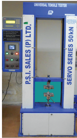
Fig. 2: Universal testing machine

to remove the band was recorded for every specimen and was measured in Newtons.