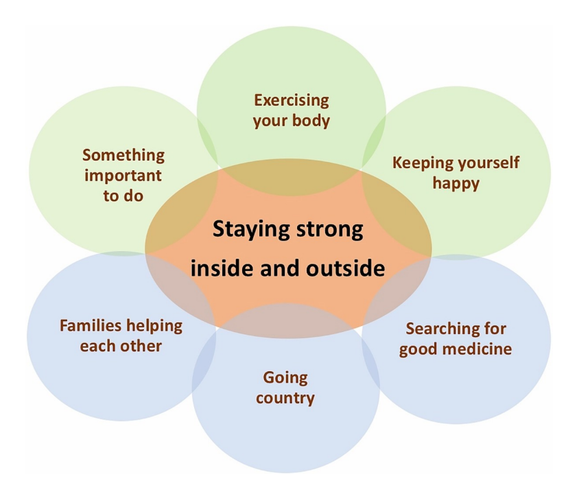
Fig 2. Framework for staying strong on the inside and outside to keep walking and moving around.

https://doi.org/10.1371/journal.pone.0212953.g002