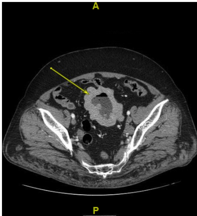
Fig. 2. CT scan of the abdomen and pelvis with an intra-abdominal mass containing internal air-fluid levels (arrow).