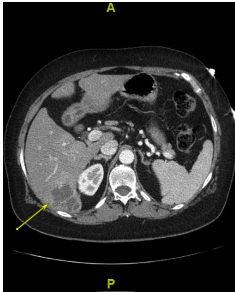
Fig. 1. Liver lesion (arrow) identified on a CT scan of the abdomen.

lae and was almost at the cut off size for the high-risk stratification, Imatinib was initiated.