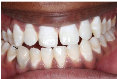
FIGURE 4: After treatment: following composite buildup and bleaching.

the permanent tooth. The practice of canine gouging may result in trauma or infection to the permanent canine tooth bud which can leave the tooth to be hypoplastic or completely atrophied. Hypoplastic teeth are known to be predisposed to caries [10, 28]. An early loss of deciduous tooth especially when it is unilateral can result in shift of the midline [29]. Rather sinister consequences are excessive bleeding, infections, osteomyelitis of jaws, noma, tetanus, meningitis, aspiration bronchopneumonia, HIV infections, hepatitis, and even death [8].