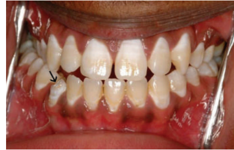
FIGURE 1: Before treatment: intra-oral views showing hypoplastic LR3.

This is a case report of a 15-year-old Somalian born boy, who presented at the paediatric dentistry department. Consent was obtained from the patient and parent to use the following information for this publication. Patient had intermittent pain in his lower right permanent canine which was associated with a discharging intraoral buccal sinus. He was