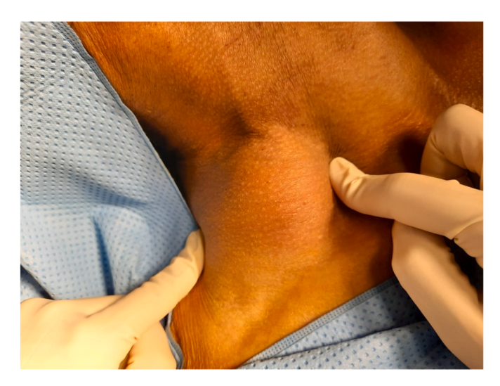
Fig 1. Long standing swelling in the right supraclavicular region.