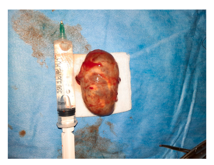
Fig 4. Excision of the mass.