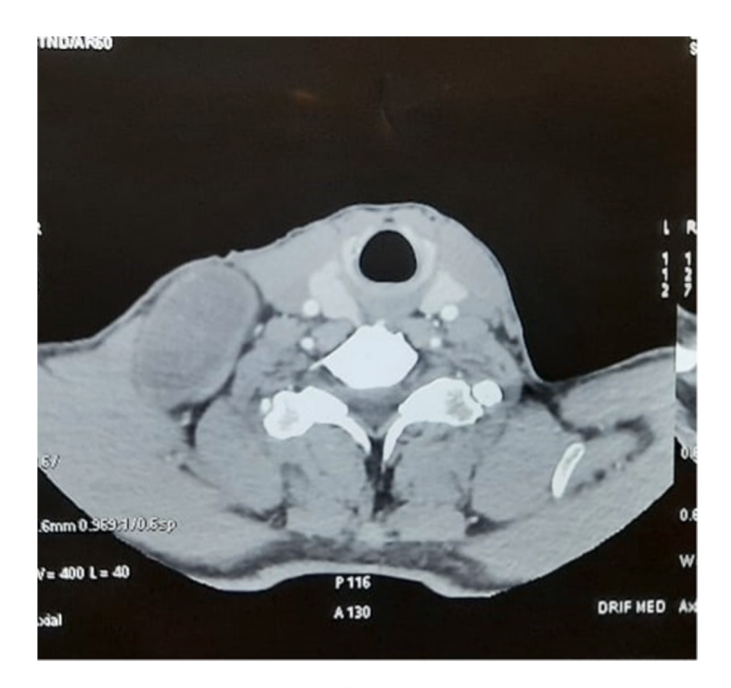
{f Fig~2} . CT scan revealing a large well-defined mass located in the right supraclavicular region.

unencapsuled, containing numerous neoformed with Cystic tumor proliferation, with elongated spindle-shaped cells with corrugated nuclei, without atypia, on a fibrous background. (FIG: 5).In immunohistochemistry, the Tumor cells express pS100 intensely and diffusely. Tumor cells do not express AML, EMA, or CD99. (FIG: 6). In the light of these findings (clinical evolution, histology, immunohistochemistry (IHC) and the imaging data), the lesion was diagnosed as solitary plexiform neurofibroma.