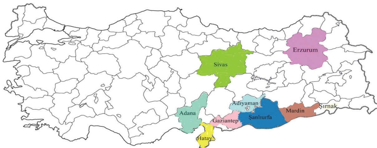
FIGURE 1: Geographical origin of honey samples.

limits they should be environmental pollutants that are hazardous for human health and trace elements such as Pb, Cd, and Al are considered as toxic and should damage the human metabolism [6, 7]. The levels of Pb, Cd, Ni, and Cr are unacceptable owing to their carcinogenic and cytotoxic influences [8]. The mineral and toxic metal content of honey have been used as a quality indicator [9]. Toxic metal levels of honey depend on the biological and geographical origin [10]. ICP-MS is a good technique with simultaneous determinations of elements, high sensitivity, capability, and wide linear range [11].