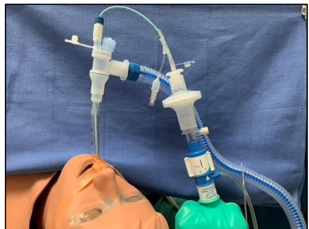
Fig. 3 A Mallinckrodt® continuous positive airway pressure (CPAP) system attached to a HEPA filter to protect against aerosol spread contamination

Studies clearly have shown an improvement on PaO 2 and maintaining oxygenation during the application of CPAP to the non-dependent and collapsed lung during OLV for VATS or RATS while the patient is operated on in lateral decubitus position. At the present time, the use of CPAP for VATS in a supine position is not recommended and finally for a COVID-19-positive patient who requires OLV