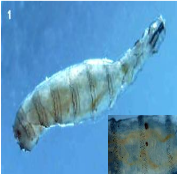
Fig. 1. The second instar larva isolated from nasal secretions suction of a 5.5-year-old girl, 2010, Iran. Spinous band indicated just around the right down corner (Original)