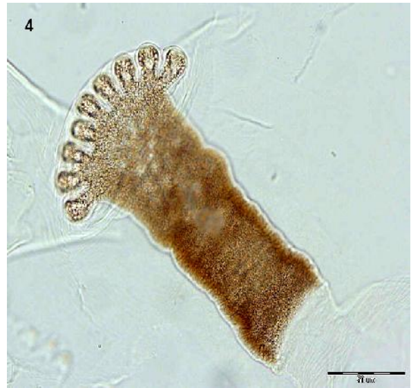
Fig. 4. Anterior spiracle of the second instar larva with 9 lobes isolated from nasal secretions suction of a 5.5-year-old girl, 2010, Iran (Original)