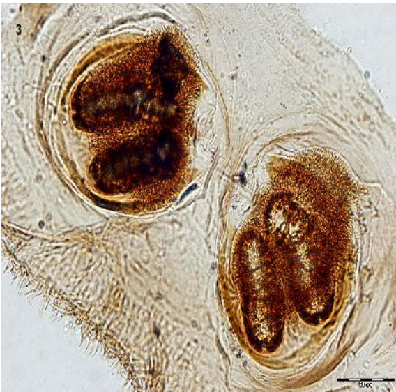
Fig. 3. Posterior spiracles of the second instar larva isolated from nasal secretions suction of a 5.5-year-old girl, 2010, Iran (Original)