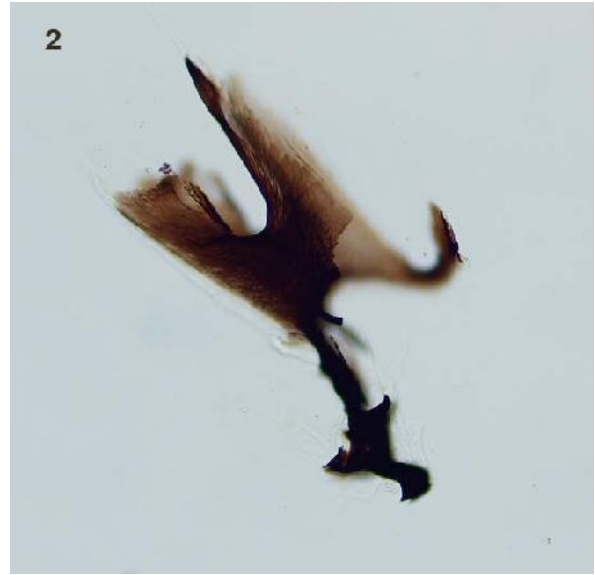
Fig. 2. The cephalo-pharyngeal skeleton of second instar larva isolated from nasal secretions suction of a 5.5-year-old girl, 2010, Iran (Original)