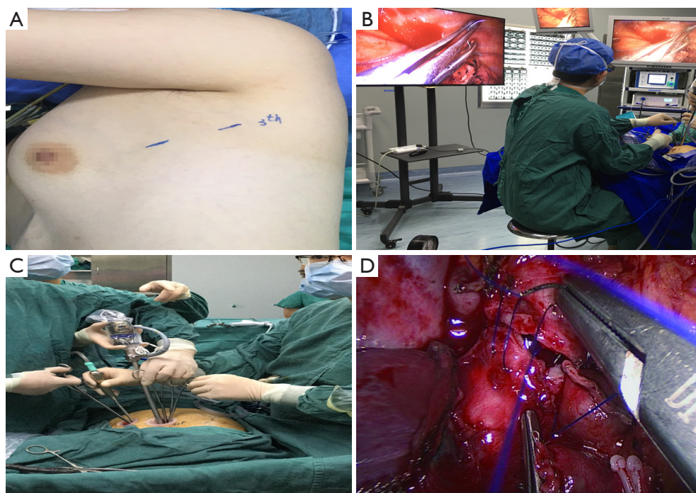
Figure 1 High-position single-intercostal two-port VATS. (A) Two incisions of approximately 2 cm are located at the same intercostal region's anterior and posterior axillary lines; (B) the surgeon may operate in a seated position to relieve fatigue; (C) the two incisions share the entrance and exit of the instrument and the mirror. During operation, the instrument, the mirror, and the chest wall are almost vertically suspended; (D) a right upper sleeve lobectomy is performed, and bronchoplasty is performed by continuous suture with a 4-0 slide thread. VATS, video-assisted thoracoscopic surgery.

anterior axillary incision, and the mirror is located on the back of the instrument. However, it is also often changed to the posterior axillary incision to obtain a satisfactory visual field. Another surgical assistant (sometimes a nurse) stands behind the patient and extends lung grasping forceps from the incision into or at the front of the axilla and pulls the lung to help expose it. Usually, the lung grasping forceps of the assistant and the mirror are not in the same port, and the instruments of the left and right hand of the surgeon are not inserted into the same port (usually the suction device is held in the left hand, and the electrocoagulation hook or ultrasonic knife is held in the right hand) ( Figure 1C ). If a diagnosis of lung cancer is not ascertained before surgery, wedge resection of the mass should be performed first to make a definite diagnosis. When a lobectomy is performed, the first step of surgery is usually to break the horizontal or oblique fissure by tunneling with an endoscopic linear stapler. Additionally, in a lower lobectomy, the pulmonary vein, bronchus, and pulmonary artery are usually treated before the oblique fissure is broken. (I) The procedure for a left upper lobectomy is as follows: first, cut off the left