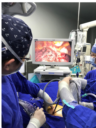
Figure 3 Intraoperative finger touch is used to determine the location of the pulmonary nodules.

position single-intercostal two-port VATS is suitable for all patients with well-developed fissures, and the upper lobe of the right lung and the lower lobe of the left lung are the most suitable sites for this surgical procedure. For patients with fissure hypoplasia, the first surgical step is usually to detach the horizontal or oblique fissure by tunneling with a cutting stapler. In this study, two patients underwent left superior lung lobectomy with poor oblique fissure development, and subsequent difficulty in tunneling resulted in conversion to three-port thoracoscopic surgery; in other words, a 1.5-cm incision was added on the 7th posterior intercostal axillary line for the use of a cutting stapler, and the oblique fissure was finally processed after the left upper pulmonary vein, bronchus and artery were severed. For complicated lobectomies, such as sleeve-type excision, the surgery time may be extensive, and the surgeon may operate in a seated position to relieve fatigue ( Figure 1B ).