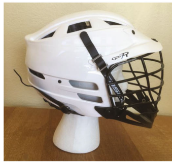
Fig 1A: Coverage provided by boys' hard shell helmet with full face mask