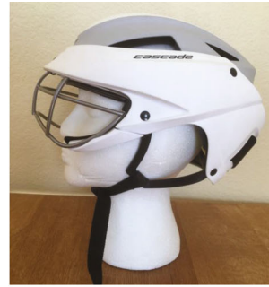
Fig 1B: Coverage provided by girls' flexible headgear with integrated eyewear