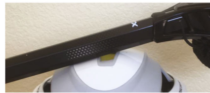
Fig 1D: Clear deformation of girls' flexible headgear when LAX stick with 10lb weight in pocket was laid across the helmet

Fig. 1 Examples of the Hard Shell Helmets Mandated in Boys' LAX and Optional Flexible Headgear Allowed in Girls' LAX. a: Coverage provided by boys' hard shell helmet with full face mask. b: Coverage provided by girls' flexible headgear with integrated eyewear. c: Lack of deformation of boys' hard shell helmet when LAX stick with 10lb. weight in pocket was laid across the helmet. d: Clear deformation of girls' flexible headgear when LAX stick with 10 lb. weight in pocket was laid across the headgear. Note: c and d document the same static, weighted lacrosse stick resting at an angle across a never worn male helmet and a never worn female headgear. There was no stick strike (e.g., no acceleration of the stick toward the helmet/headgear) when the photos were taken