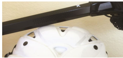
Fig 1C: Lack of deformation of boys' hard shell helmet when LAX stick with 10lb weight in pocket was laid across the helmet