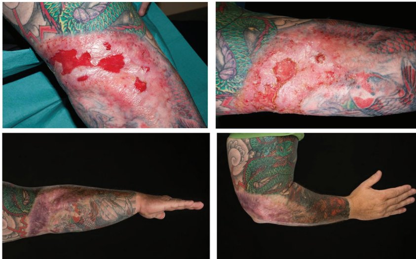
Figure 3. Laser settings and treatment. First cycle DeepFX® 20 mJ 600 Hz 2-10-1-10% to whole scar right elbow (including ulceration) with 100 mg of 5-Fluouracil and 40 mg of Triamcinolone injected to the thickest hypertrophic components.