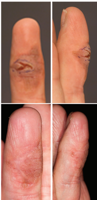
Figure 4. Laser settings. A single ablative CO 2 laser treatment with the Ultrapulse® 2 mm true spot hand piece 175 mJ multiple passes to ablate the hyperkeratosis and with the fractional DeepFX® 15 mJ 300 Hz 2-6-1-10% to whole scar right (including ulceration).

the senior author given his experience using multiple modalities. Individual case presentations are given to aid support for scar improvement following these treatments. Over the next decade further