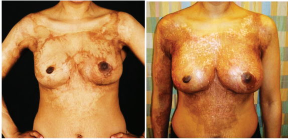
Figure 1. Laser settings. First cycle DeepFX® 12.5 MJ 600 Hz 2-10-1-5%, ActiveFX® 80 mJ 3-7-3. Second cycle DeepFX® 20 mJ 600 Hz 20 mJ 2-10-1-5. Final cycle SCAAR FX™ 150 mJ for thickest resistant scar bands and 60 mJ for the remainder, 600 Hz and 2-10-1-1% and ActiveFX® 80 mJ 3-7-3.

stiff scars over right elbow region. He underwent one session of ablative CO 2 laser therapy in combination with intralesional chemotherapy and pharmacotherapy. After one treatment, the wound was fully epithelialised and stable on full elbow flexion with an improvement of texture, thickness and pliability after 3 months. Pictures pre treatment (top row) and post treatment (bottom row).