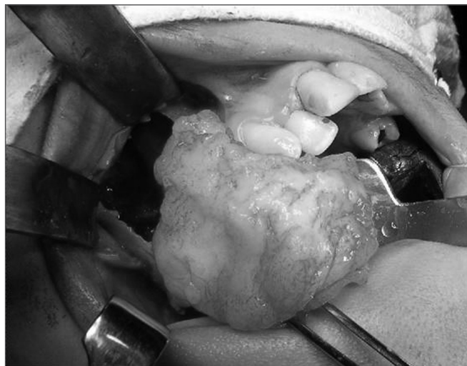
Figure 2. Transoperative view showing bone resection to remove a maxillary odontogenic myxoma.

New preoperative exams were ordered and they were all within normal parameters. We then operated her under inhaling anesthesia and nasotracheal intubation. Through a modified Neuman incision we exposed the anterior wall of the maxillary sinus and cut the bone, removing the entire tumor together with teeth numbers 15, 17 and 18, which were affected by the lesion that measured 5cm in its largest diameter (Figure 2). Histopathology of the surgical specimen confirmed the diagnosis of odontogenic myxoma, because of the presence of spindle-like cells,