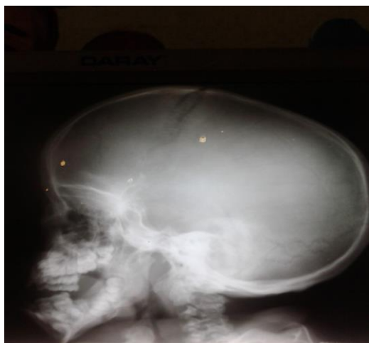
Figure3: Lateral skull X-ray showing a widened J-shaped sella turcica

AA identified using cellulose acetate Hb electrophoresis. Serum electrolytes were essentially normal. Lateral skull X-ray showed a widened J-shaped sella turcica (Figure 3). There was a reduction in the vertical height, posterior displacement and anterior beaking of L3 vertebra and reduction of L2-L3 disc space (Figure 4). Echocardiography showed mitral valve prolapse with severe regurgitation, moderate pericardial effusion and severe pulmonary hypertension.