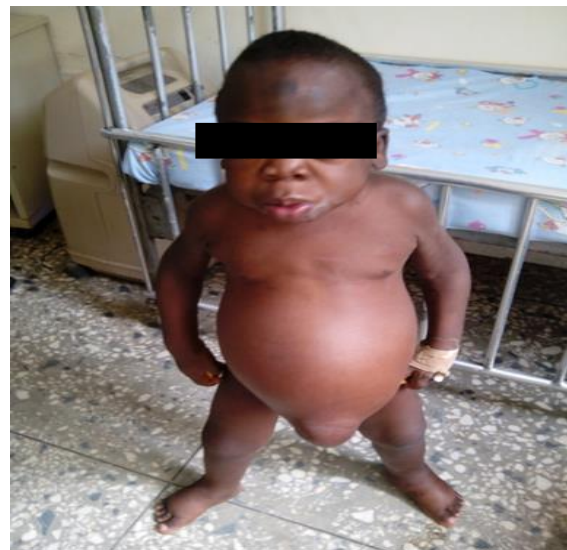
Figure 2: Slightly flexed forearms at elbow joints and gross abdominal distension with umbilical hernia

He had tachycardia, hyperactive precordium and apex beat in the 5 th intercostals space 2cm lateral to midclavicular line. There was grade 3 pansystolic murmur loudest at the apex, radiating to the axilla. He was tachypneic and had transmitted sounds in the chest. The abdomen was distended with an umbilical hernia (Figure 2); there was tender hepatosplenomegaly and ascites demonstrable by fluid thrill.