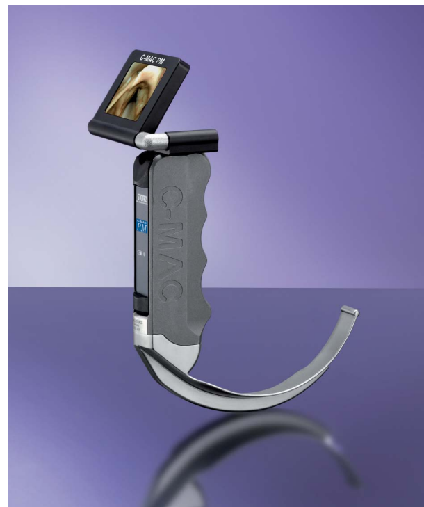
Figure 2 Photograph of C-MAC PM (Karl Storz, Tuttlingen, Germany).

JAMQ study is a prospective multicentre data registry to investigate the factors associated with the improvement of intubation skills among novice physicians (postgraduate year (PGY) 1) using a high-fidelity simulator, with all data collection planned a priori. 6 12 The JAMQ study was initiated in April 2015 as a consortium of two academic hospitals (University of Fukui Hospital and University of Tsukuba Hospital) and two community medical centres (Fukui Prefectural Hospital and Tokyo Bay Urayasu/Ichikawa Medical Center) from different geographic regions across Japan. In the JAMQ study, we examined the intubation skills every year by using both different simulation scenarios and intubation devices. The present study utilises the data collected in April 2015 (the beginning of a new term).