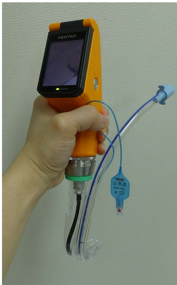
Figure 1 Photograph of Airway Scope AWS-S100L (Pentax Corporation, Tokyo, Japan).

We retrospectively analysed data from the Japanese Airway Management Quantification (JAMQ) study. The