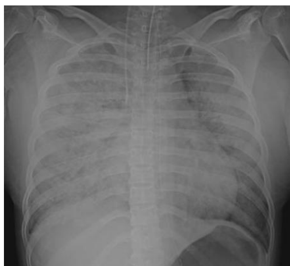
Figure 2 The patient's chest X-ray on admission to the intensive care unit. Diffuse infiltration was observed throughout the lungs.

pressure ventilation at the following conditions: spontaneous and timed mode; F_{I}O_2 of 1.0; inspiratory positive airway pressure of 14 cmH_2O ; and expiratory positive airway pressure of 10 cmH_2O . When her SpO_2 increased to 90%, we performed intubation and found that there were no signs of laryngeal edema or aspiration. Mechanical ventilation was started in assist and control mode, F_{I}O_2 of 1.0, pressure control of 15 cmH_2O , positive end expiratory pressure (PEEP) of 15 cmH_2O , and tidal volume of 350 ml. Arterial blood gas analysis showed the following values: pH 7.06; PaO_2 138 mmHg; PaCO_2 69 mmHg; base excess -11.9 mmol/L; and lactate 3.0 mmol/L. Chest X-ray demonstrated diffuse infiltration throughout the lungs (Figure 2). There were no abnormal findings in her coagulation, kidney and liver functions. Cultures of tracheal aspirate, urine, and blood proved to be negative.