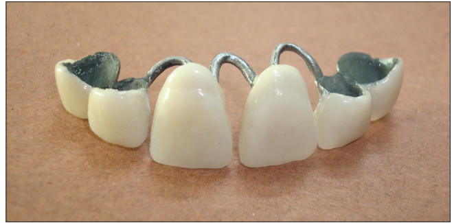
Figure 6: The final prosthesis

This clinical report discussed a method for fabrication of a