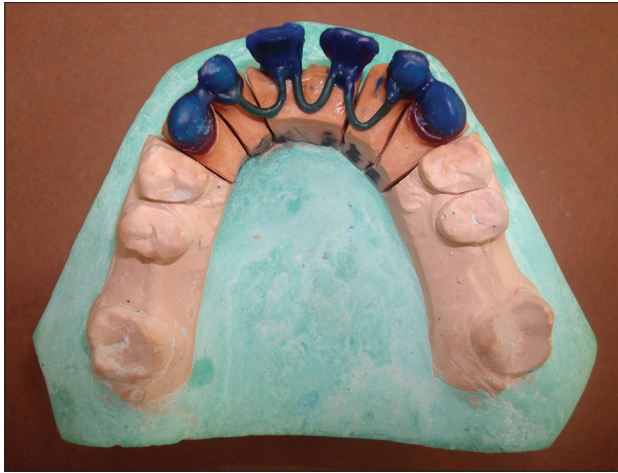
Figure 5: The wax up for 06 units bridge with loop connectors