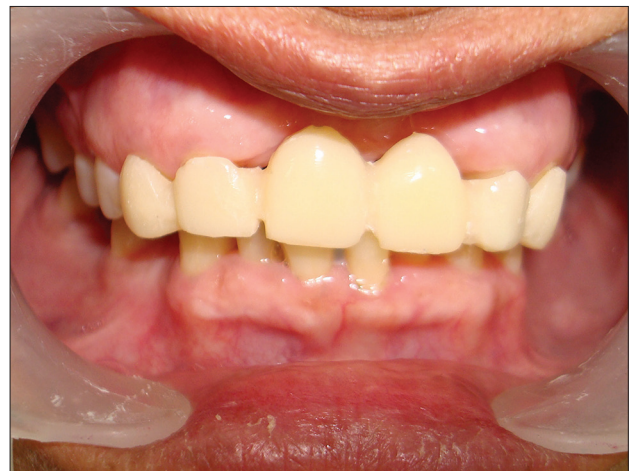
Figure 4: The cemented provisional crown