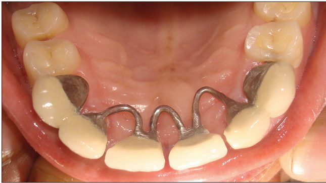
Figure 7: The FPD cemented in mouth

Their designing determines the health of periodontal ligament under FPD. They may be either rigid or non-rigid. The presence of the missing central incisors with a wide span is a difficult esthetic problem to resolve with conventional FPDs. The modified FPD with loop connectors enhance the natural appearance of the restoration, maintain the diastemas and the proper emergence profile, and preserve the remaining tooth structure of abutment teeth. However, this type of prosthesis requires additional laboratory procedures. In addition, the prosthesis design may cause difficulty in maintenance and may affect in phonetics especially linguopalatal sounds. However keeping the connectors round and small in size will not affect the phonetics.