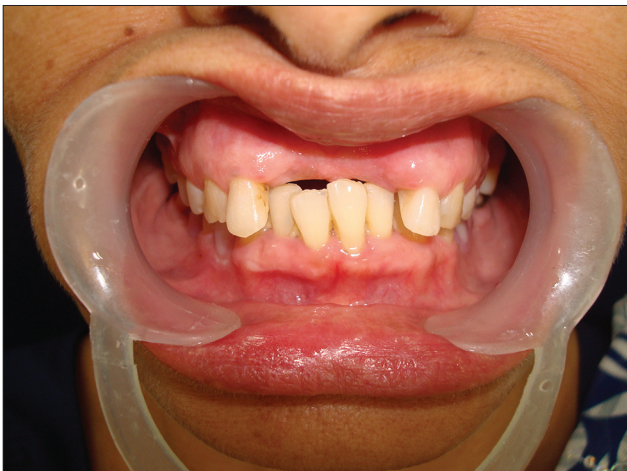
Figure 1: Preoperative picture showing missing teeth

Connectors basically link different parts of FPD (i.e., pontic and retainers). Thus constitute an important part of FPD.