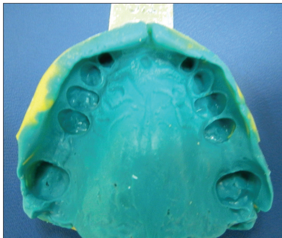
Figure 3: The final impression of the prepared teeth