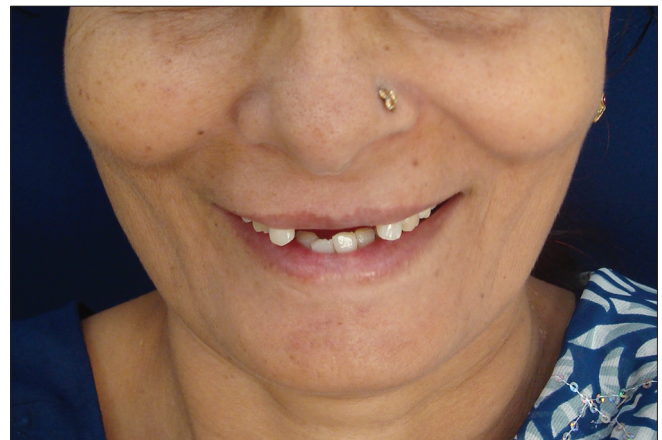
Figure 2: Extraoral picture showing missing teeth