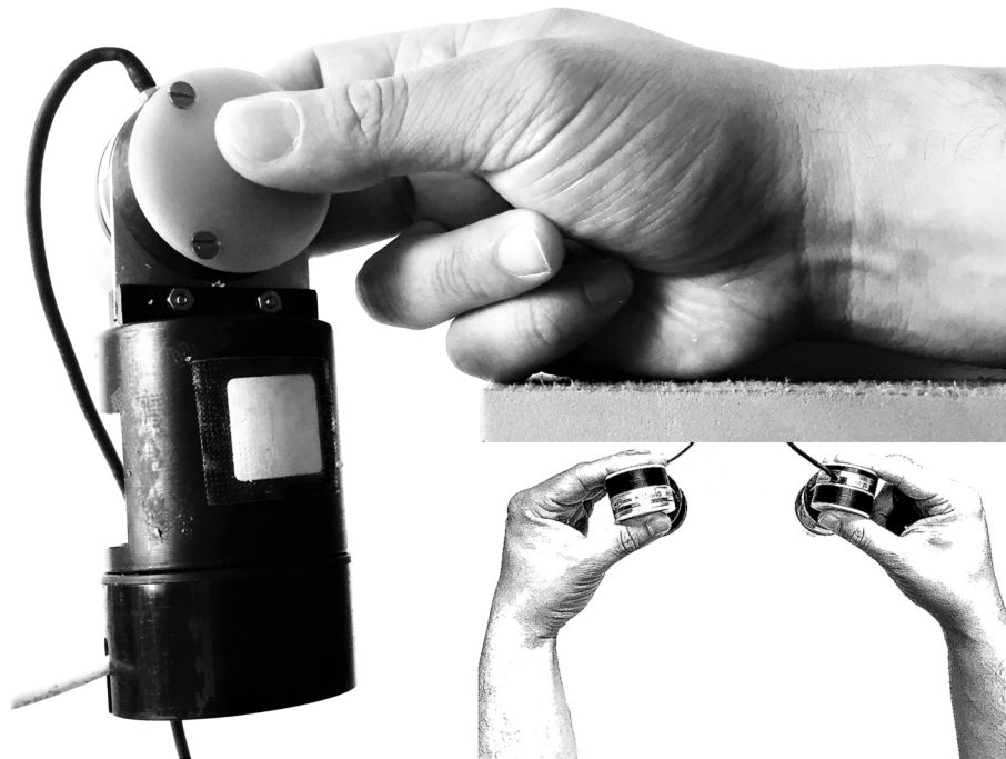
Fig 1. Grip force sensor held by means of a tri-digital pinch. Arm support extends to the fifth metacarpal head while the sensor remains hanging in the gap. The sketch in detail shows the symmetrical bimanual positioning and displays the neutral position of flexion/extension of the wrists.

https://doi.org/10.1371/journal.pone.0192320.g001