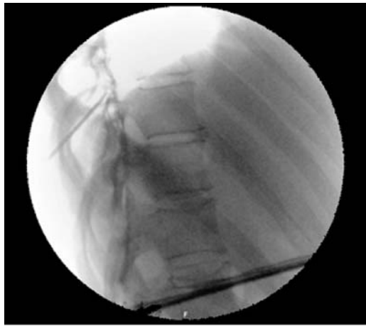
Figure 1 Fluoroscopic image showing radio-opaque contrast spread into the epidural space

puncture and disappears within fourteen days. 1 The headache worsens within fifteen minutes of resuming the upright position, and disappears or improves within thirty minutes of resuming the recumbent position. The exact pathophysiology of PDPH remains unclear, but is thought to be due to a persistent leak of cerebrospinal fluid (CSF) from the subarachnoid space as a result of the dural puncture, resulting in a fall in both CSF volume and pressure. 2 The reduced CSF volume may cause gravitational traction on pain-sensitive intracranial structures, resulting in the postural headaches, and may cause direct activation of adenosine receptors, which further stretch these structures in addition to causing cerebral vasodilatation. 3 Approximately 1–2% of epidural blocks result in unintentional dural puncture, with headaches occurring in 30–70% of these cases. 4