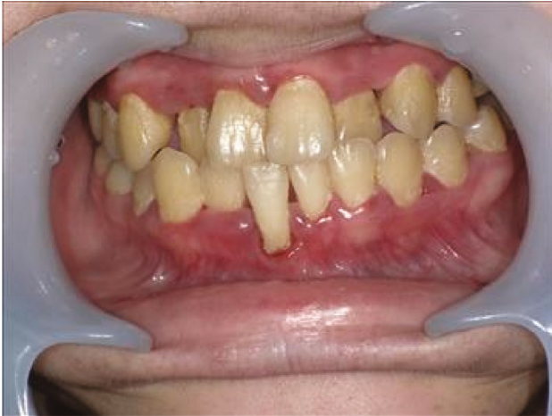
FIGURE 1: Intraoral view at the initial visit. Gingival swelling and redness were present throughout the oral cavity, and gingival retraction of the right lower central incisor was evident.