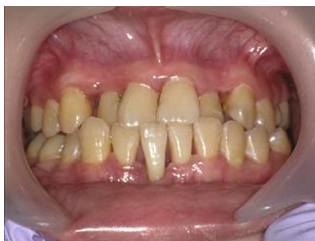
FIGURE 3: Oral condition 7 weeks after stem cell transplantation. Mild gingival swelling was evident, and the redness had improved. Bleeding was absent during scaling or brushing.

stomatitis associated with chemotherapy and radiotherapy through a physical mode of action. It became commercially available in Japan in 2018. It protects the surfaces of ulcers and erosions and relieves pain by forming a bioadhesive film. Hadjieva et al. [9] reported that the use of Episil® in patients who underwent radiotherapy for head and neck cancer provided significant pain relief.