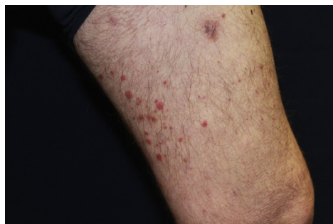
Fig 1. Mixed cryoglobulinemic vasculitis. Patient 1: physical examination found erythematous nonblanching papules and patches on lower legs and medial thighs.

All subsequent measurements of HCV viral load showed undetectable levels. However, he continued to have admissions for acute kidney injury, fevers, and rash associated with positive serum cryoglobulins whenever attempts were made to reduce plasmapheresis treatments to fewer than once a week. He was started on cyclophosphamide and corticosteroids in June 2013 in addition to continuation of weekly plasmapheresis, in an attempt to reduce cryoglobulin production. He was subsequently treated with azathioprine, cyclophosphamide, mycophenolate mofetil, and finally rituximab in 2015. This treatment led to a brief remission of symptoms, but rituximab was required again after a relapse in May 2016. Rituximab has improved clinical symptoms, but the patient remains plasmapheresis dependent.