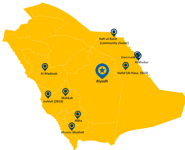
Figure 2 A map of the Kingdom of Saudi Arabia showing main clusters: Riyadh (The Capital); Hofof (Al-Hasa 2013 outbreak); Jeddah (2014 outbreak); and the holy Cities Makkah and Al-Madinah (the described outbreak in this report).