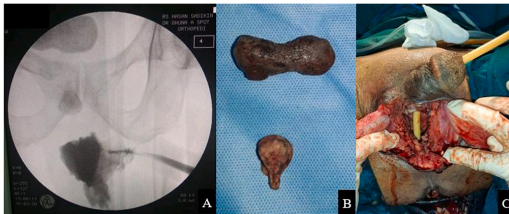
Fig. 2. A) Retrograde urethrography. B) The bladder and urethral stone. C) Evaluation of the scrotal area showed a urinary catheter that leads to the scrotal area.

He was consulted to the internal medicine department and diagnosed with hospital-acquired pneumonia. On the third day after the operation, the respiratory problem worsened, he then was intubated and moved to the intensive care unit (ICU). The patient's condition was not improved despite all attempts, the patient died due to respiratory failure.