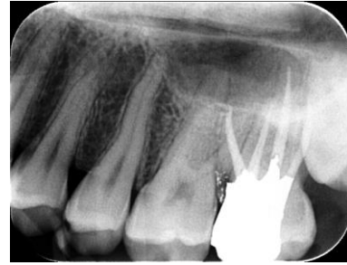
Fig. 3: After six months of follow-up

On panoramic view (Fig. 1C) nothing noteworthy was detected regarding the root anatomy of the left second molar. However, in axial planes from the chamber floor to the more apical levels, the presence of two P canals (DP and MP) was confirmed (Fig. 1D).