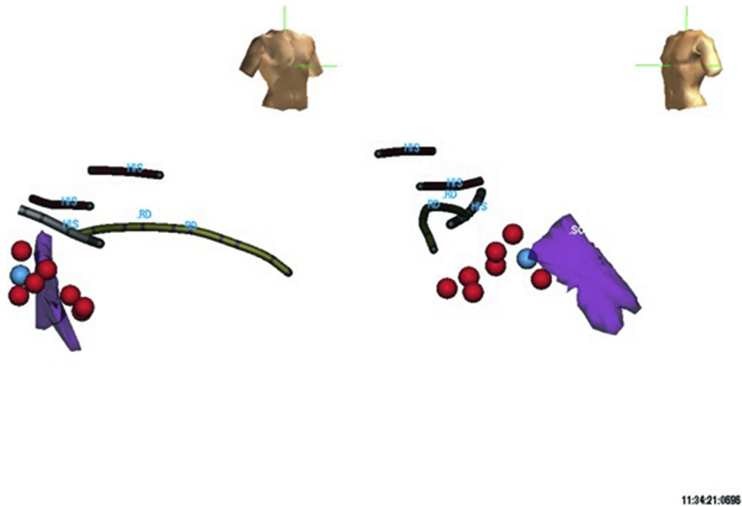
Fig. 1. Positioning of the catheters during ablation of nodal reentrant tachycardia. Left image (right anterior oblique view) shows catheter shadow with right bundle branch identification and His bundle region. It should be noted that the potential of His was identified in a region up to 1 cm in height. In the right image (left anterior oblique view), we note this fact, where we observed three levels of His, one more caudal, another intermediate and another more cranial. In part this may be due to the movement of the heart and the modification of the chest impedance during deep inspiration. However, it is important to clearly delineate this region to perform a safe application of radiofrequency. The structure in lilac is the coronary sinus. The blue spot (near the entrance of the coronary sinus) demonstrates a place where we obtained slow junctional rhythm. In red are other regions where the application of energy (15 s) did not trigger slow junctional rhythm.