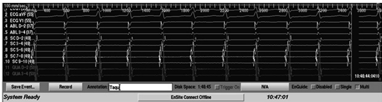
Fig. 2. Recording of supraventricular tachycardia initiated with the introduction of atrial extrastimuli at an earlier age. A VA interval <60 ms is observed during tachycardia and concentric retrograde atrial activation.