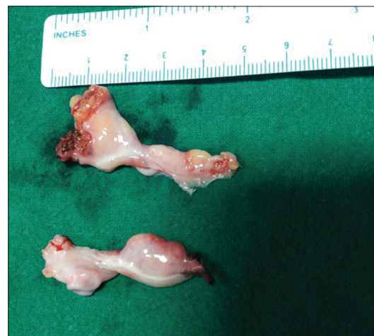
Figure 3: Specimen showing streak gonads

the Mullerian ducts develop into uterus, fallopian tube, cervix, and vagina.