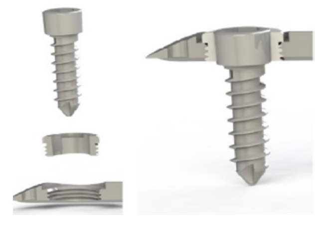
Figure 1. Locking coupling mechanism. Three single components of locking mechanism: conically-head screw, conically shaped bushing inserts with external threads and threaded hole plate (left). Conical screw- bushing insert coupling and threaded bushing insert-plate coupling

All patients were treated by standard open reduction and internal fixation according to anatomic segment injured. In all case of diaphyseal simple fracture a compression screw and neutralization plate fixation was performed. In case of comminuted diaphyseal fracture and periarticular fractures a bridge locking plate fixation was performed. O'Nill plate system is composed by a series of anatomical shaped plates to restore original anatomy of the bone. An intermediary bushing-like insert which locks the screw and threads into the plate is placed in all holes. Standard compression screws are positioning into oval holes or into standard hole before bush removal (Fig. 1) Angular stable locking plating is guarantee by a conical coupling locking mechanism between the screw head and