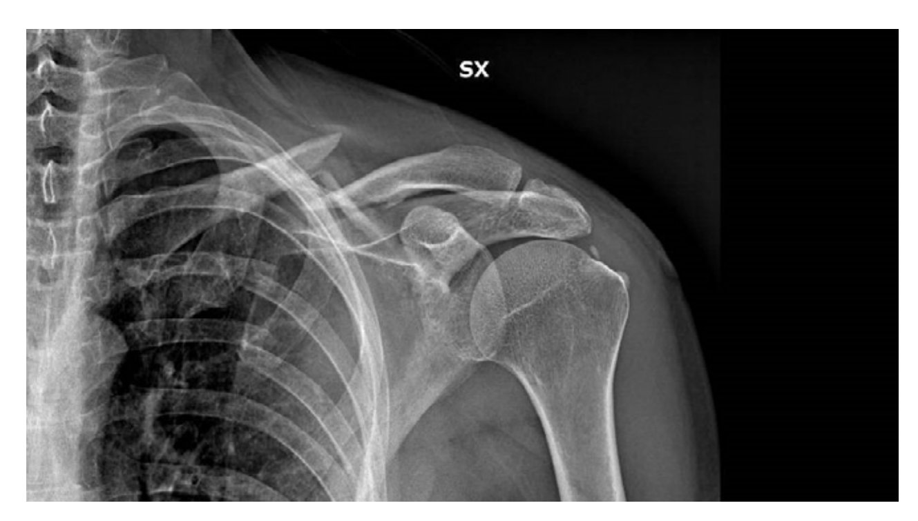
Figure 3. Pre operative radiograph of left clavicle fracture.