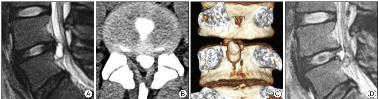
Fig. 1. A : Preoperative magnetic resonance (MR) sagittal image showing discal cyst on L4-5. B and C : Preoperative discogram with 3D reconstruction computed tomography showing a connecting channel between the cyst and the corresponding disc. D : Postoperative MR image showing discal cyst which has been successfully removed. 3D : 3-dimensional.

If cyst membrane could not be removed completely, a multiple fenestration of membrane was done by radiofrequency (RF) electrocautery. We made multiple fenestration of residual membrane in 2 cases. During removal of discal cyst and decompression of nerve root, we frequently had met bleeding due to adhesion of structures of peridiscal cyst. However, it could be controlled by bipolar coagulation and saline irrigation. Finally, we were able to expose the involved nerve root moving freely (Fig. 2).