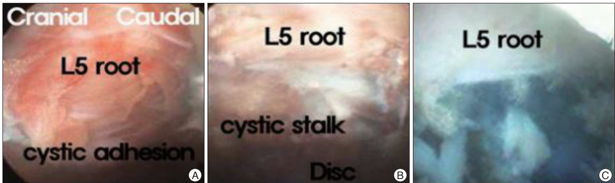
Fig. 2. Endoscopic view of discal cyst by transforaminal approach. A : Right L5 nerve root is compressed by discal cyst with adhesion. B : Discal cystic stalk is connected to disc material beneath the L5 nerve root. C : L5 nerve root could be free after removal of discal cyst as well as cystic stalk.