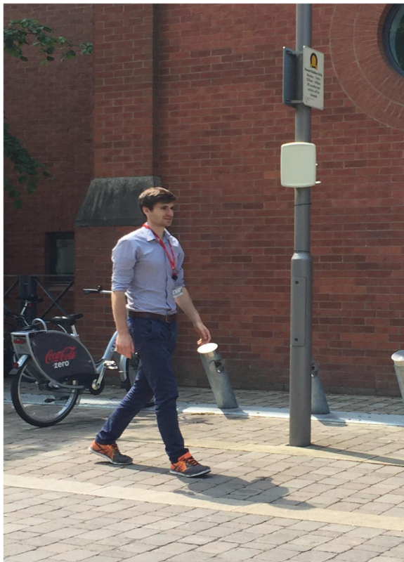
Fig. 1 Physical activity monitoring system

To tailor the intervention, a purposive sample of employees (both men and women across a range of ages) will participate in three focus groups (maximum 10/group) prior to the intervention to explore aspects such as the availability of, and preferences for opportunities for physical activity proximal to the workplace. Sensor locations will be determined from the feedback received in the focus groups regarding popular walking routes. Employees' opinions on the website interface and the rewards redemption function, for example, will also be considered. To determine incentive levels we will use stated preferences of the participants from the DCEs to assess their mean Willingness to Accept (WTA), Willingness to Pay (WTP) and the trade-offs they would make for the attributes [35] of the incentive programme, prior to the intervention. This information will help us determine the level of the rewards available for earned 'points' (further detail below).