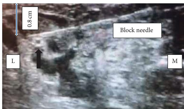
FIGURE 3: ICBN with block needle positioned immediately before local anaesthetic infiltration. Black arrow indicates the hyperechoic ICBN (M: medial; L: lateral).

Some ultrasound-based studies have suggested even lesser volumes [3]. Given the relative inexperience on ultrasound-guided ICBN blockade, the authors opted for a higher volume to avoid failure of the block. Real-time use of colour mode and repetitive aspiration with low-pressure injections excluded intravascular and intraneuronal entry (in the absence of nerve stimulator). The patient did not require additional analgesia throughout the procedure. Supplemental oxygen requirement was static.