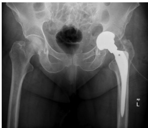
Figure 4. Postoperative anteroposterior radiograph after conversion of the bipolar hemiarthroplasty to total hip arthroplasty.

Hasegawa et al. described three types of dissociation based on the location of the locking ring in a series of seven cases of bipolar prosthesis dissociation due to marked polyethylene wear: type I, where the locking ring is loosened but the femoral ball is not