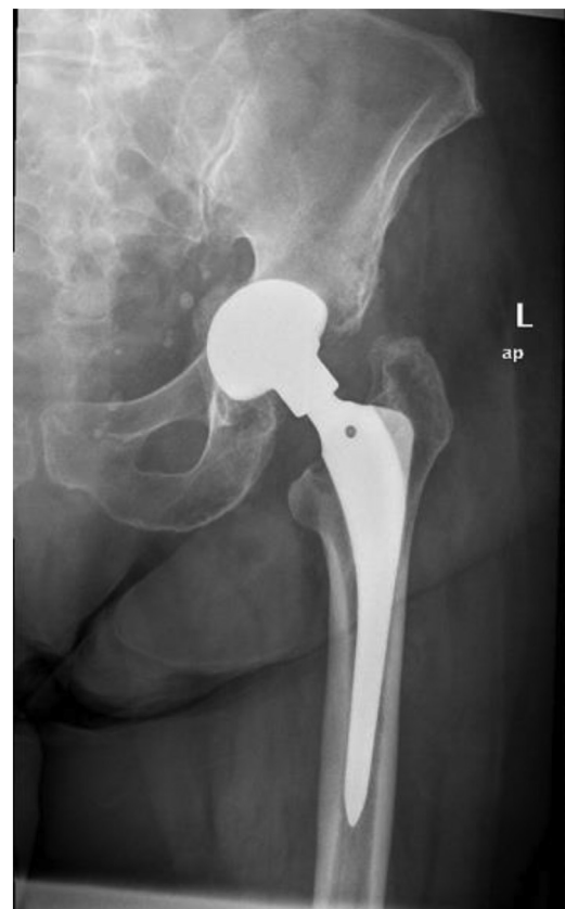
Figure 5. Anteroposterior radiograph of the left hip at 1-month follow-up after conversion to a total hip arthroplasty.