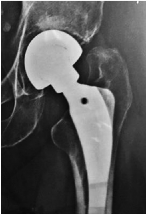
Figure 1. Patient's initial postoperative anteroposterior radiograph of a left hip bipolar hemiarthroplasty.