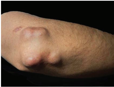
FIGURE 2: Right elbow with multiple firm nodules with overlying yellow-red papules.

erosions which can be present in the early diagnosis of rheumatoid arthritis. Unfortunately, the patient failed to follow up with any further radiologic imaging appointments.