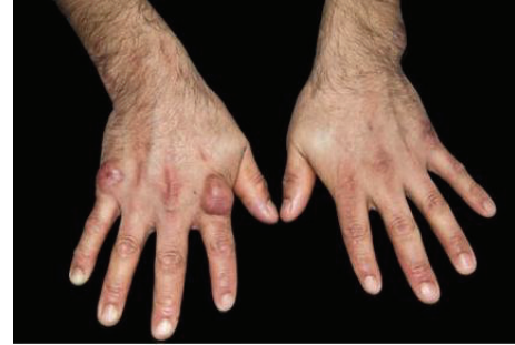
FIGURE 3: Bilateral hands with firm, nonmobile, nodular growths over the joints of the 2nd and 5th metacarpal phalangeal joints.

It was initially suspected that our patient had rheumatoid nodules secondary to rheumatoid arthritis despite the lack of joint signs or symptoms on presentation. Although the laboratory workup revealed an unremarkable rheumatoid factor and negative ANA screening without radiographic disease, our differential diagnosis remained possible SGA, benign rheumatoid nodules, cat scratch, and calcinosis cutis. Our patient had an unusual presentation as the lesions on his lower extremities suggested that SGA was more likely than benign rheumatoid nodules. A punch biopsy was taken of one of the nodules. The initial report was inconclusive. However, it demonstrated a collagenized soft tissue mass composed of small and large geographic areas of collagen degeneration, surrounded by a histiocytic reaction. Bluish discolorations were noted, which indicated mucin accumulation. Pathological evaluation of a repeat biopsy noted that within the lower