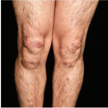
FIGURE 1: Bilateral lower extremities demonstrating multiple firm, nontender nodules over the knees and shins with overlying yellow plaques.