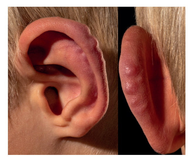
Fig. 1. Small, blue-violet papules on the helix of the left ear, each around 3-mm diameter and with a soft consistency.

What is your diagnosis? See next page for answer.