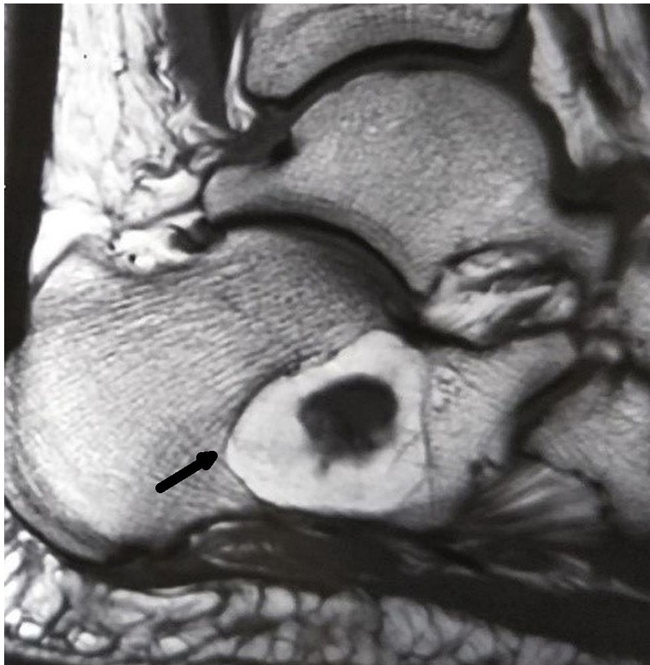
FIGURE 2: Magnetic resonance imaging of the right ankle at presentation

An MRI of the right ankle was sought, which showed a lesion in the calcaneum with hyperintense signals on T1-weighted sagittal images, which is characteristic of fatty tissue, in addition to minimal effusion in the plantar fascia (Figure 2).