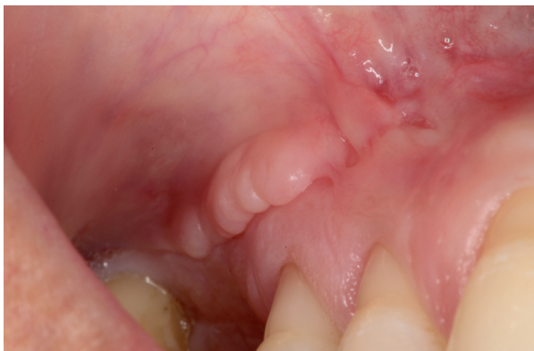
Fig. 3. Three-months follow up.

The postoperative period was uneventful and suture was removed after 15 days. At 3 months' follow-up, the patient did not refer any symptoms and the OAC was completely closed (Fig. 3).