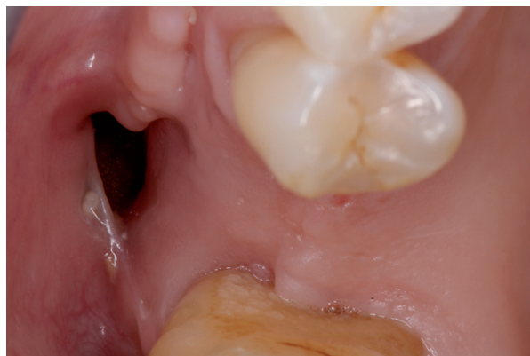
Fig. 1. Baseline: clinical features.

exploration was performed. Rounded painless OAC of 1.5 cm diameter located at the buccal aspect of the right maxillary molar region (Fig. 1).