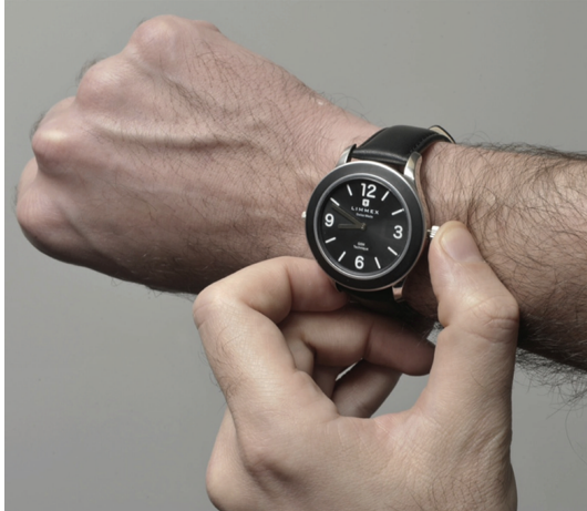
FIGURE 1: Limmex emergency wrist watch: there are two crowns, the one on the left for adjusting time and the one on the right (the larger one) for triggering the emergency call.