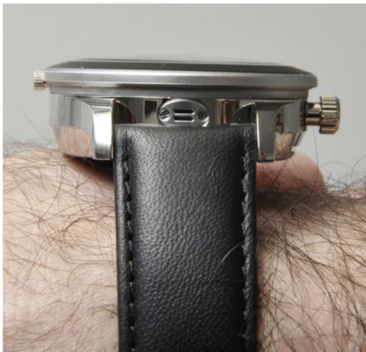
FIGURE 2: Limmex emergency wrist watch: wrist shot showing the dimensions of the watch and the microphone.

or severe allergies, pregnant women, or adolescents with juvenile diabetes—any of whom might find themselves in an emergency situation and need immediate assistance. We are currently testing the watch in several patient groups. The use of Limmex can also have a positive repercussion on the healthcare system itself; patients who would have been hospitalized for a longer time for surveillance or for social reasons would be able to be discharged home with a hospital-sponsored Limmex for a limited time; this would allow the patients to call for help at all times once at home and might enhance their quality of life and free hospital beds. The Limmex watch can be used outside or even inside just anywhere where you have wireless coverage, thus the wearer is able to count on a reliable system which operates outside his own four walls, is discreet, and which requires no special